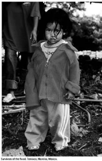
Survivors of the flood. Temixco, Morelos, Mexico.

I can also make available a reduced version of one of my dissertation chapters.